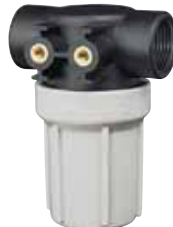
AA122-ML Compact Liquid Strainer