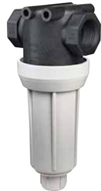
AA126ML-5 or -6