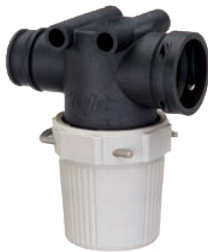
AA122ML-QC Compact Liquid Strainer