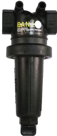
3/4" & 1"