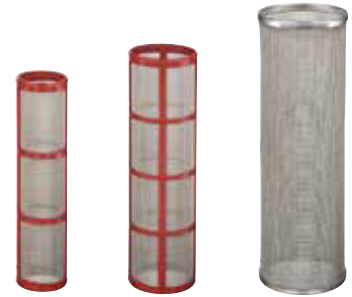
CP16903 CP15941 CP14634

Maximum temperatures up to 38°C/100°F. Viton® O-ring seal supplied with 3/4" and 1" Nylon models; EPDM supplied with 3/4" and 1" polypropylene models; Buna-N gaskets supplied with 1-1/4" and 1-1/2" sizes. Viton optional.