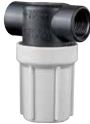
AA122-PP Compact Liquid Strainer

The AA122 line strainer features a compact size that is well suited for small agricultural and turf sprayers. The AA122 is constructed of polypropylene head and bowl with stainless steel screen for excellent chemical resistance and is available with 1/2" or 3/4" (F) NPT pipe connections. The maximum pressure rating is 150 PSI (10 bar).