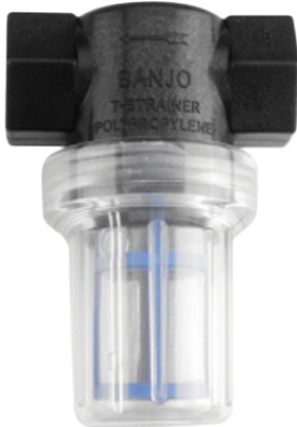
1/2" Mini T-Strainer with Clear Bowl