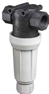
AA126ML-3 or -4