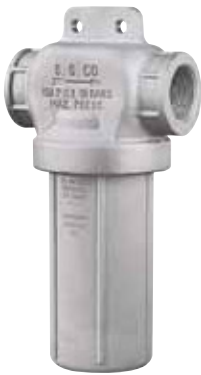
AA124ML-AL (with mounting holes)