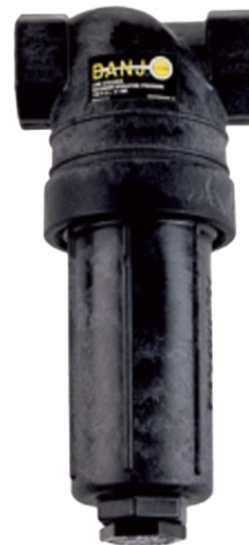
1-1/4" & 1-1/2"