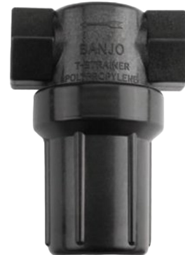
1/2" Mini T-Strainer with Black Bowl